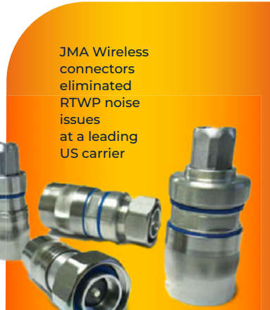
JMA Wireless connectors eliminated RTWP noise issues at a leading US carrier

A leading US mobile network operator decided to use the concealment method by placing a cell tower in a local church steeple. The mobile operator avoided community opposition to the conventional cell tower, but unfortunately experienced another problem instead – chronic RTWP (Received Total Wideband Power) noise issues across all existing lines. RTWP is related directly to Uplink Interference, which causes performance degradation. Many valuable hours and much money was spent trying to identify the source of the connection issue.