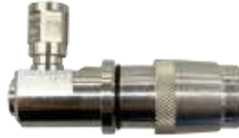
UXP-1RT-38S-01 Nex10 connector