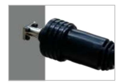
Slide the WPS-4MT-38S-01 over the port seal until ribs are no longer visible.