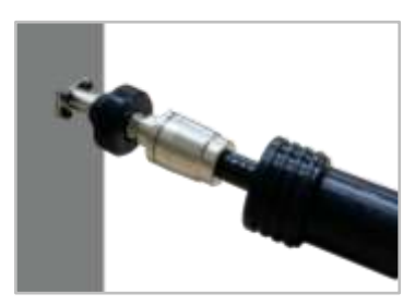
Mate the male connector to the port.