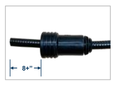
Prior to cable prep, slide the WPS-4MT-38S-01 boot onto the 3/8" cable at least 8" from the end.