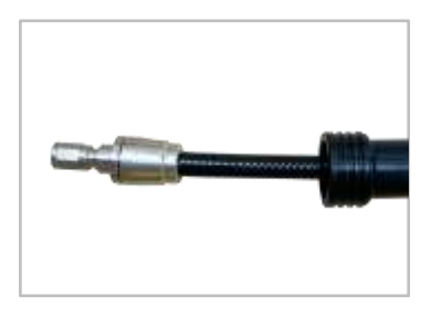
Prep the 3/8" cable and install the JMA 3/8" 1MT connector. Refer to the connector installation instructions for this step.