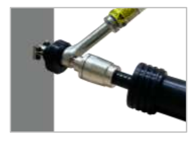
Torque the connector to 2.2 lbf-in using the TW-716-F2.2 torque wrench.