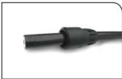
Prior to cable preparation, slide the WPS-7 onto the 1-5/8" cable 6-10 inches from the end.