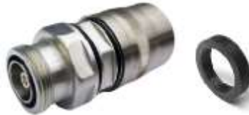
JMA 7/8" DIN connector with port seal