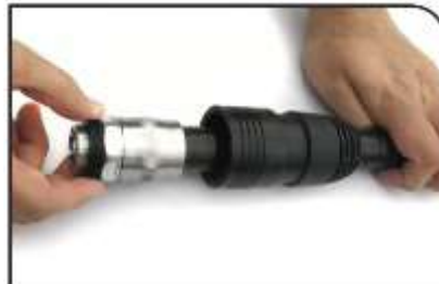
Properly installed port seal.