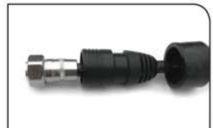
Prep and install the 1/2" cable to install the JMA compression connector. Refer to the 1/2" connector install instructions.