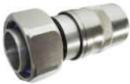
JMA 1/2" DIN connector