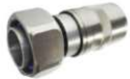
JMA 1/2" DM connector