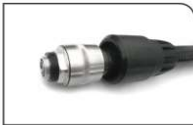
Properly installed port seal.