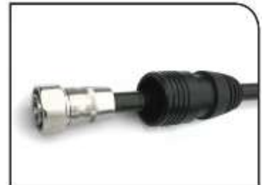
Prep and install the 1/2" cable to install the JMA compression connector. Refer to the 1/2" connector install instructions.