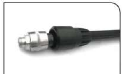
Prep and install the 1-5/8" cable to install the JMA compression connector. Refer to the 1-5/8" connector install instructions.