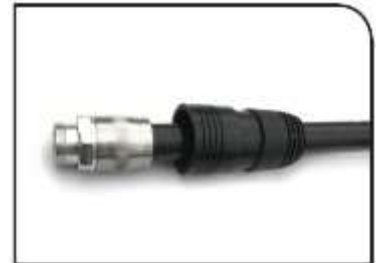
Prep and install the 7/8" cable to install the JMA compression connector. Refer to the 7/8" connector installation instructions.