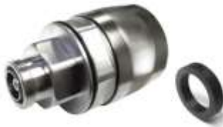
JMA 1-5/8" DIN connector with port seal