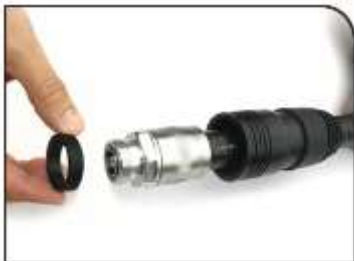
Place the port seal onto the female connector.