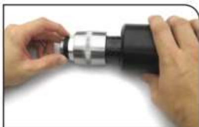
Place the port seal onto the 1-5/8" connector.