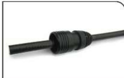
Prior to cable preparation, slide the WPS-4A or WPS-4S onto the 1/2" cable 6-12 inches from the end.