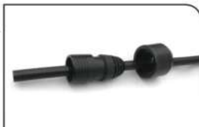
Place the 1/2" to 1-5/8" coupler onto the cable as shown. Prior to cable preparation, slide the WPS-4A or WPS-4S onto the 1/2" cable 6-12 inches from the end.