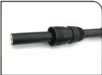
Prior to cable preparation, slide the WPS-5 onto the 7/8" cable 6-12 inches from the end.