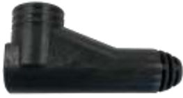
WPS-2RT-14S weatherproofing boot