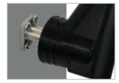
Properly installed WPS-2RT-14S. NOTE: all ribs of the port seal are fully covered by the WPS.