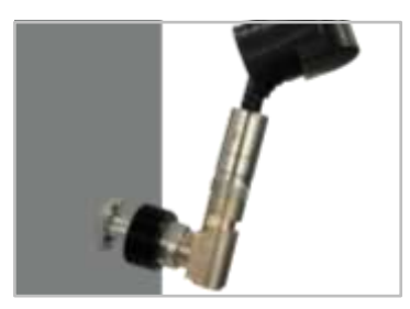
Mate the male connector to the port.