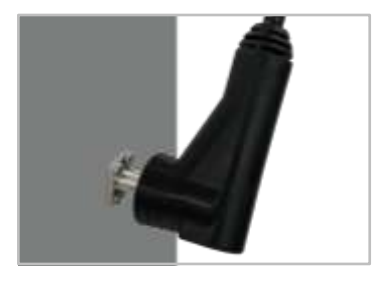
Slide the WPS-2RT-14S over the port seal until ribs are no longer visible.