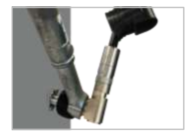
Torque the connector to 6 lbf-ft using the TW-916-F6 torque wrench.