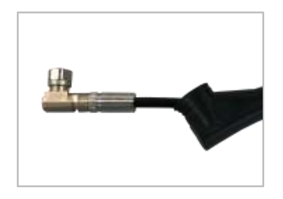
Prep the 1/4" cable and install the JMA 1/4" 2RT connector. Refer to the connector installation instructions.