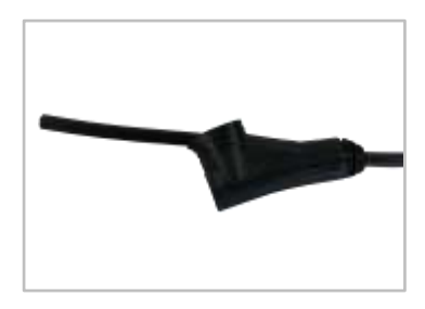
Prior to cable prep, slide the WPS-2RT-14S boot onto the 1/4" cable 8–12" from the end.