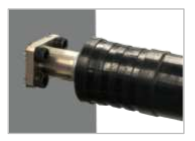
Properly installed WPS-1MT-14S. NOTE: all ribs of the port seal are fully covered by the WPS.