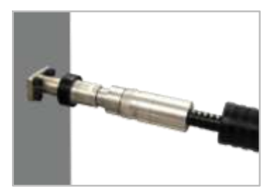
Mate the male connector to the port.