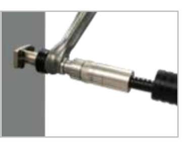
Torque the connector to 3.7 lbf-ft using the TW-716-F3.7 torque wrench.