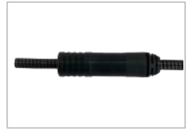
Prior to cable prep, slide the WPS-1MT-14S boot onto the 1/4" cable 8-12" from the end.