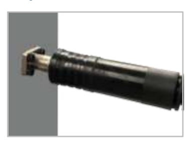
Slide the WPS-1MT-14S over the port seal until ribs are no longer visible.