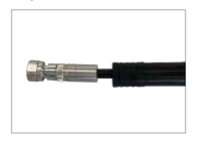
Prep the 1/4" cable and install the JMA 1/4" 2MT connector. Refer to the connector installation instructions.