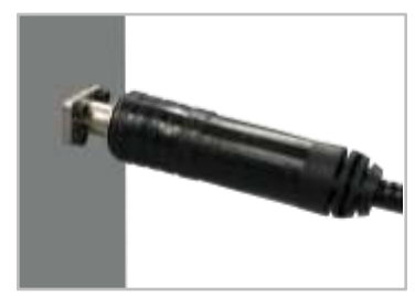
Slide the WPS-2MT-14S-01 over the port seal until ribs are no longer visible.