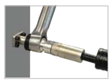
Torque the connector to 6 lbf-ft using the TW-916-F6 torque wrench.