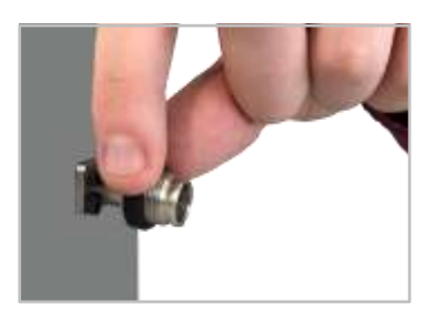
Install port seal with tapered side toward the nut. Seal is black in color