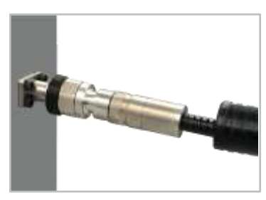
Mate the male connector to the port.