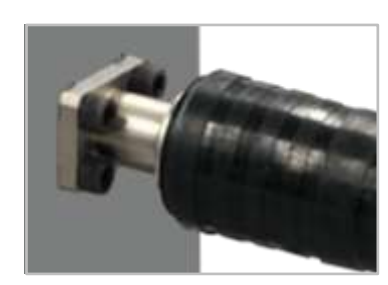
Properly installed WPS-2MT-14S-01. NOTE: all ribs of the port seal are fully covered by the WPS.