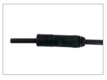
Prior to cable prep, slide the WPS-2MT-14S-01 boot onto the 1/4" cable 8–12" from the end.