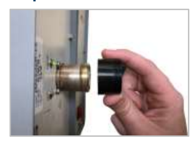
Place the cut WPS-DF onto the antenna or device female port.