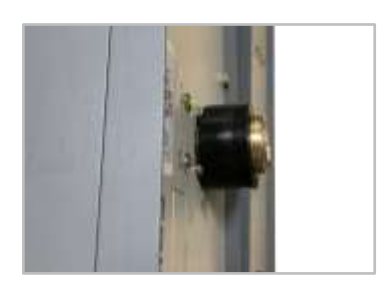
Properly installed WPS-DF.