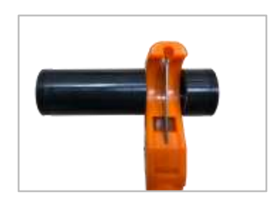
Properly measured WPS-DF.