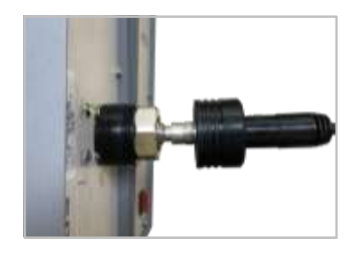
Properly mated connector.