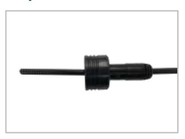
Prior to cable prep, slide the WPS-DM-14S onto the 1/4" cable 6–12" from the end.