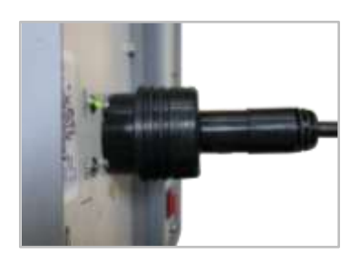
Completed installation of the JMA Weather Protection System.