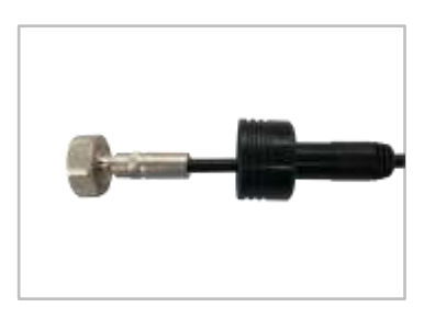
Prep and install the 1/4" cable to install the JMA 1/4" UXP compression connector. Refer to the 1/4" corrugated connector installation instructions.