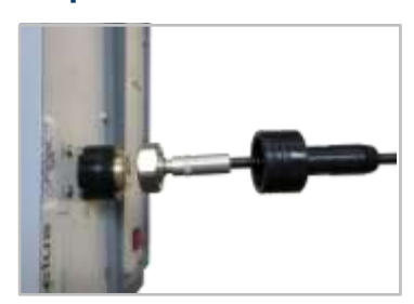
Connect the 1/4" connector to the antenna port or device, and hand