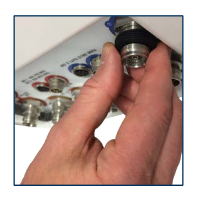
Install the port seal, with text "This side away from nut" toward antenna port or device.