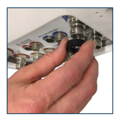
Place the port seal onto the antenna or device female port.