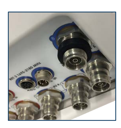
Properly installed port seal, positioned just past the threads.