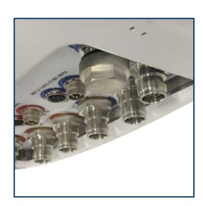
Properly installed PC-4MT.