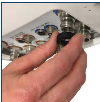
Place the port seal onto the antenna or device female port.