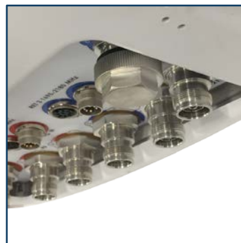
Properly installed PC-4MT.