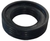
WPS-4F port seal