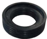
WPS-4F port seal