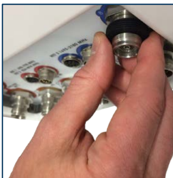
Install the port seal, with text "This side away from nut" toward antenna port or device.