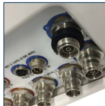
Properly installed port seal, positioned just past the threads.