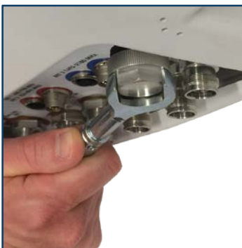
Torque the connection to 8 lbf-ft using the TQ-78-F8 torque wrench.