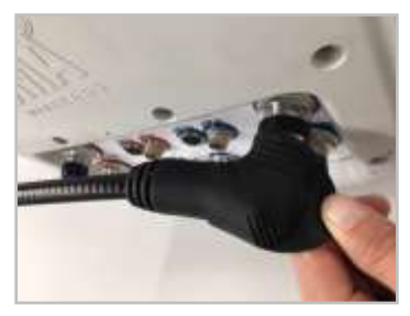
Install the boot by sliding it over the elbow using the pull tab.