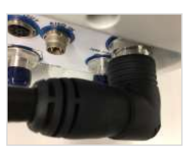
Another angle of a properly installed right angle boot. NOTE : All port seal ribs are completely covered.