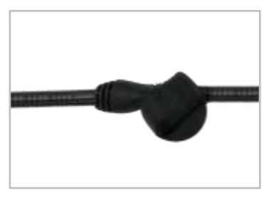
Before prepping, slide the boot onto the cable so that the connector opening is facing the end of the cable.