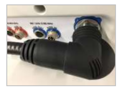
Properly installed right angle boot. NOTE : All port seal ribs are completely covered.