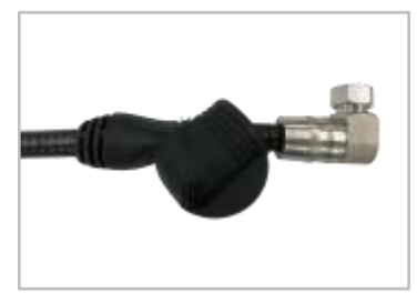
Prep the cable and then install the connector to complete installation. Use the instructions provided with the connector for this step.