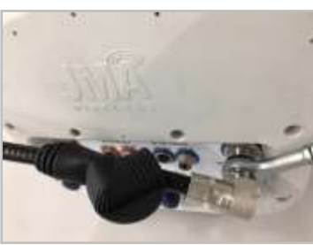
Torque the connector using the torque wrench. See cross reference chart for the correct torque wrench.

©2024 JMA Wireless. All rights reserved. This document contains proprietary and confidential information. All products, company names, brands, and logos are trademarks <sup>14</sup> or registered® trademarks of their respective holders. All specifications are subject to change without notice. Revised: March 7, 2024 +1 315.431.7100 customerservice@jmawireless.com