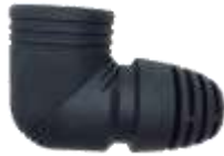
WPS-DRA-4A or WPS-DRA-4S