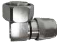
DRA connector (DIN Right Angle)