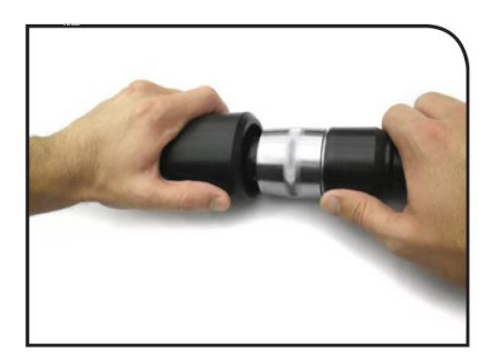
Slide the WPS-7 over the 1-5/8" connector and slide onto the coupler.