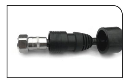
Prep and install the 1/2" cable to install the JMA compression connector. Refer to the 1/2" connector install instructions.