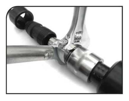
Torque the connection to 18 ft-lbs using the TQ-114-F8 torque wrench and an adjustable wrench or 1-1/2" open-ended wrench.