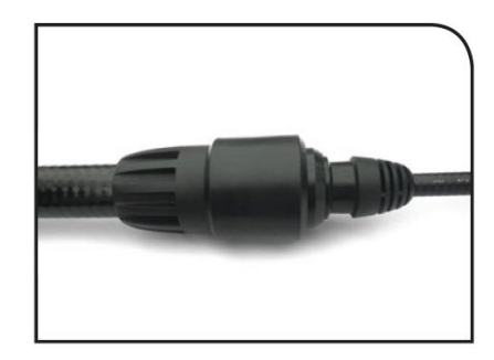
Completed installation of the JMA Weather Protection System.