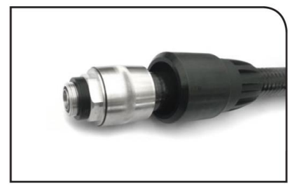
Properly installed port seal.