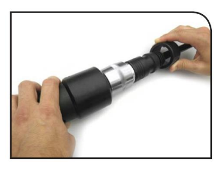
Install the 1-5/8" to 1/2" coupler to the WPS-4A or WPS-4S.