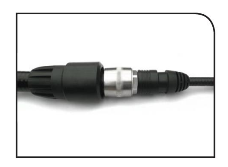
The WPS-4A or WPS-4S should cover the port seal entirely as shown.