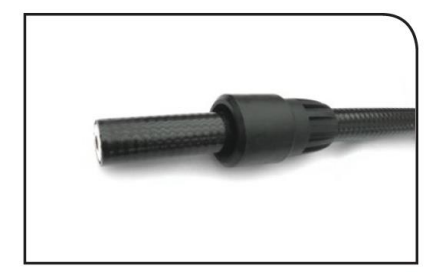
Prior to cable preparation, slide the WPS-7 onto the 1-5/8" cable 6-10 inches from the end.