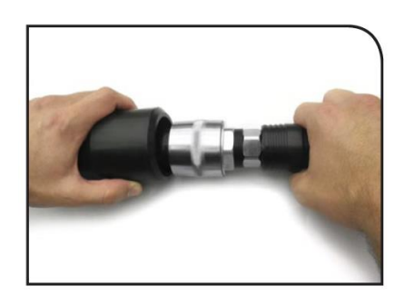
Slide the WPS-4A or WPS-4S over the 1/2" connection making sure to overlap the port seal.