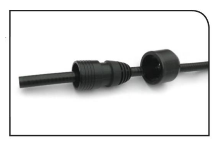
Place the 1/2" to 1-5/8" coupler onto the cable as shown. Prior to cable preparation, slide the WPS-4A or WPS-4S onto the 1/2" cable 6-12 inches from the end.