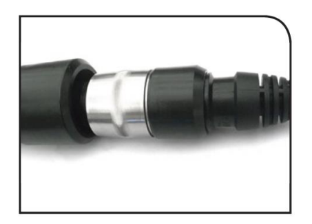
Properly installed coupler. Note that the coupler rests flush against the 1-5/8" connector.