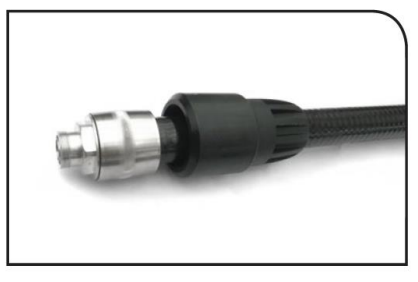
Prep and install the 1-5/8" cable to install the JMA compression connector. Refer to the 1-5/8" connector install instructions.